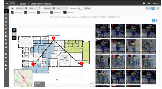
See the person's path chronologically on a map