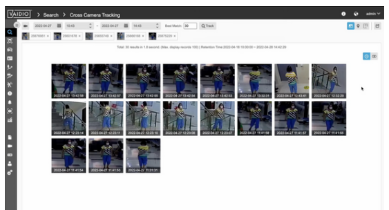
Vaidio pulls up all instances of that person